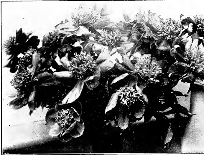
The Mikado, a good example of the Japanese type. One of the best crimson. See page 14.